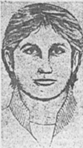
SACRAMENTO RAPIST A composite view

Hardware stores' stocks of heavy-duty locks, burglar alarms and guns are nearly depleted by residents fortifying their homes.